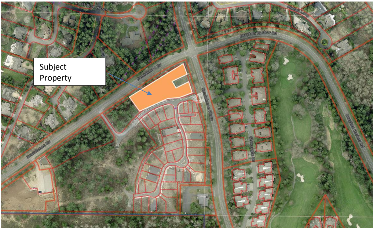
Figure 1- Vicinity Map