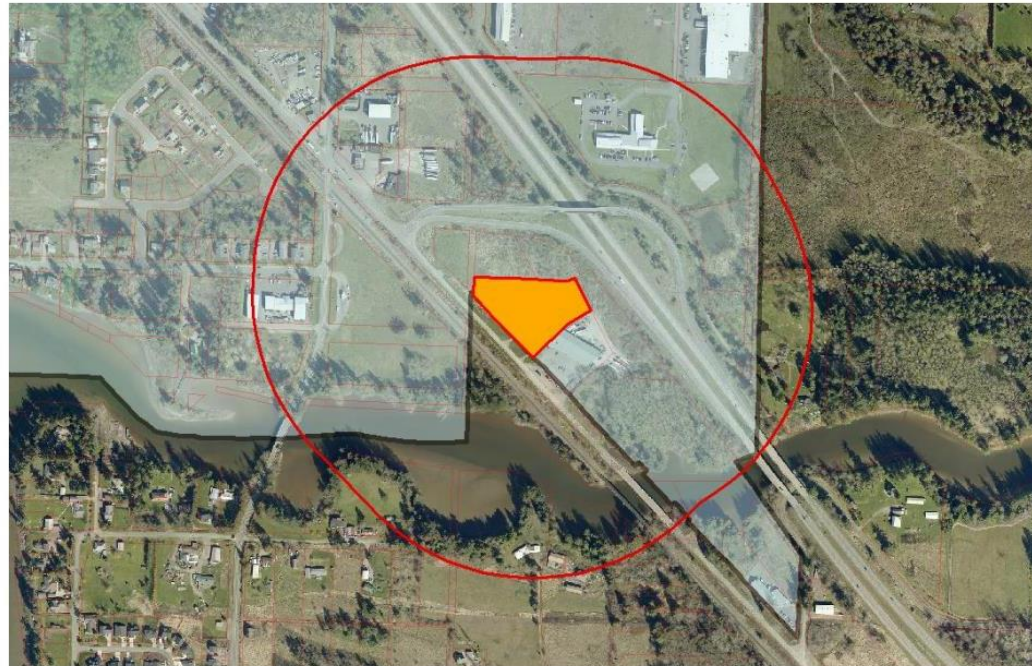
Attachment G: Marijuana Citing Criteria Buffer